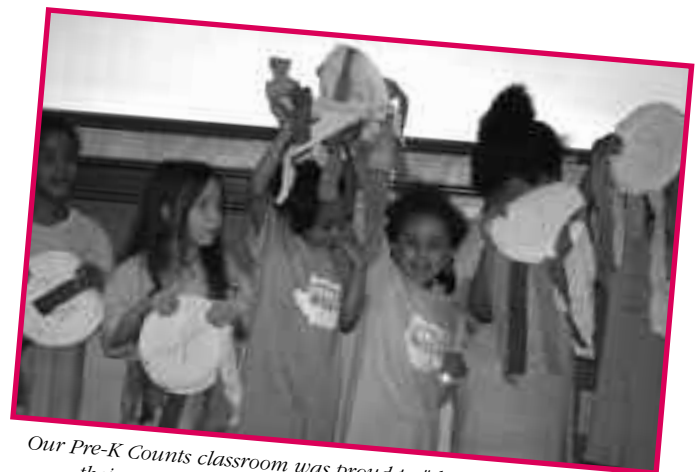
Our Pre-K Counts classroom was proud to "shake, rattle, and roll" their way through their Annual Meeting performance.